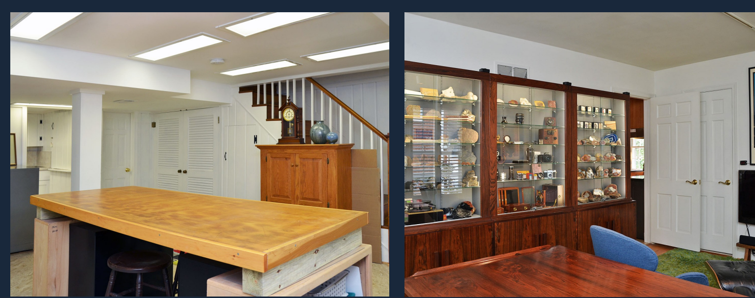
Lower Level Entertainment room