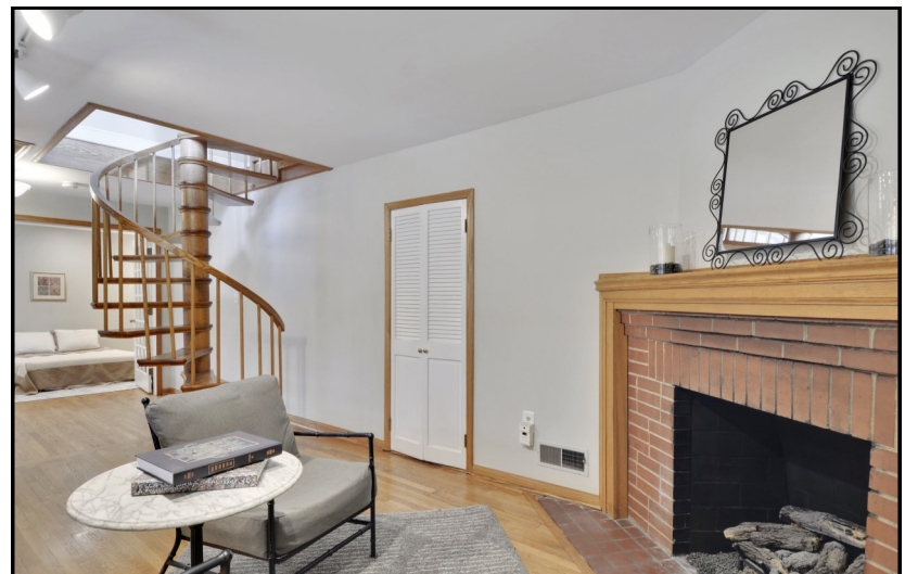
Lower Level daylight Rec Room w/ FPL