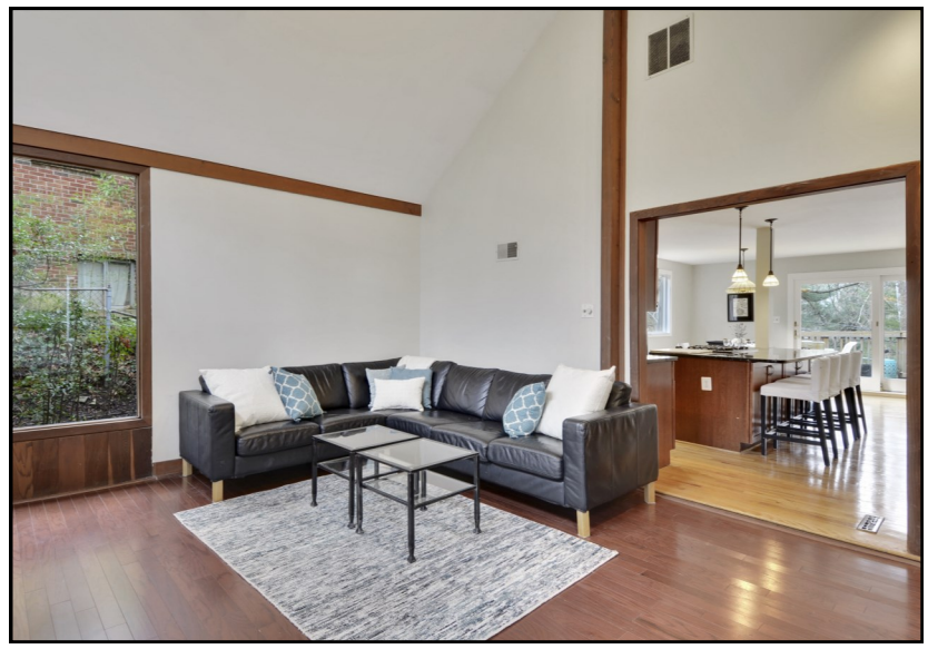
Cathedral ceiling Family Room off the Kitchen