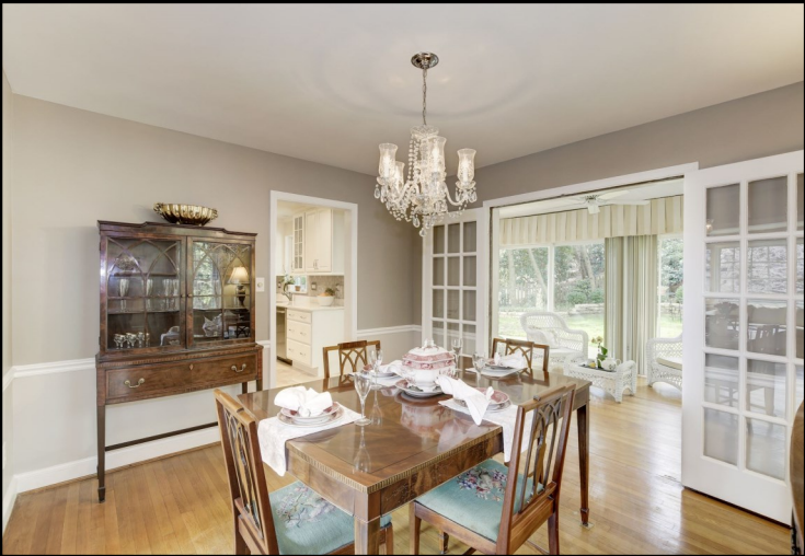
Dining Room open to Sun Room and Kitchen