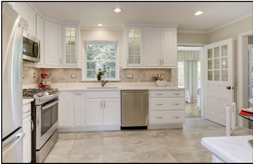
Kitchen with view of adjacent Sun Room