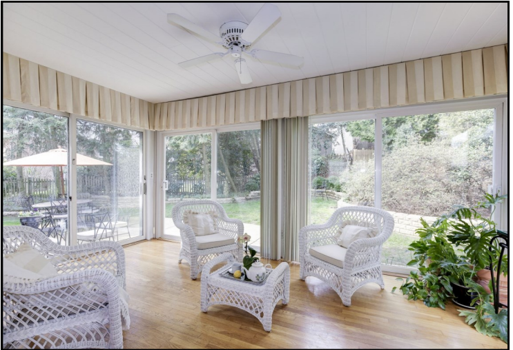
Sun Room looks out to lush rear garden