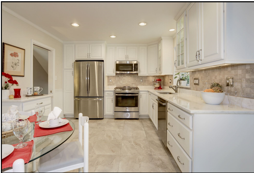
Another view of the Kitchen