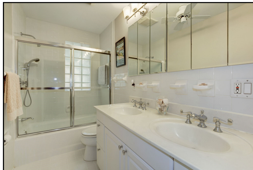
Hall Bath on Bedroom Level