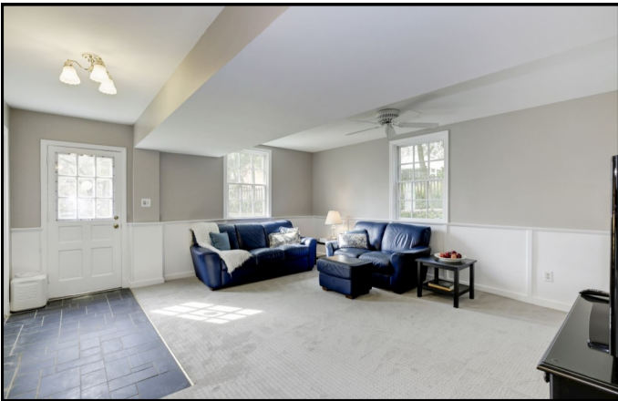
Lower level Family Room