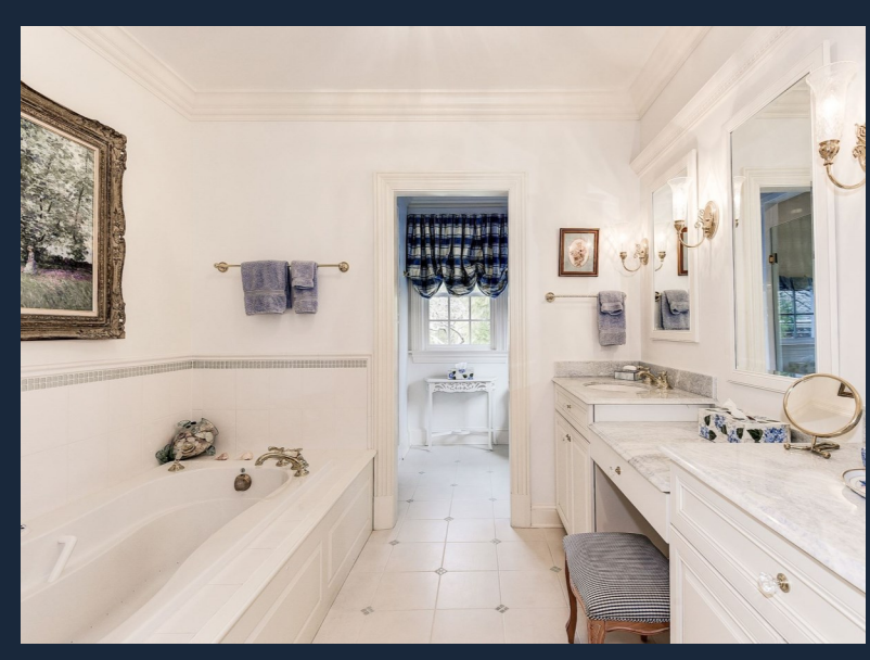
Master bath 1