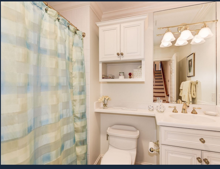
2nd level hall bath