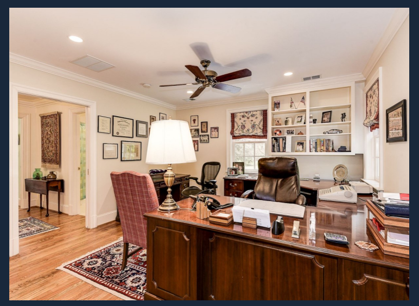
Original master bedroom/office