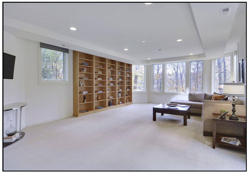
Library / Multi-purpose Room