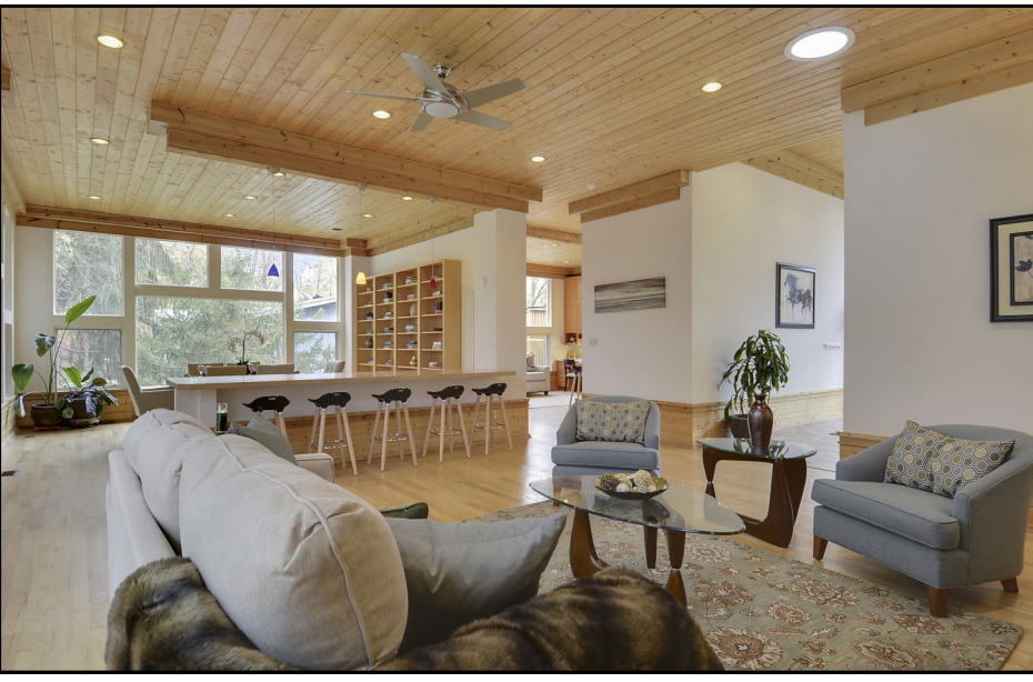
Family Room open to Dining Room