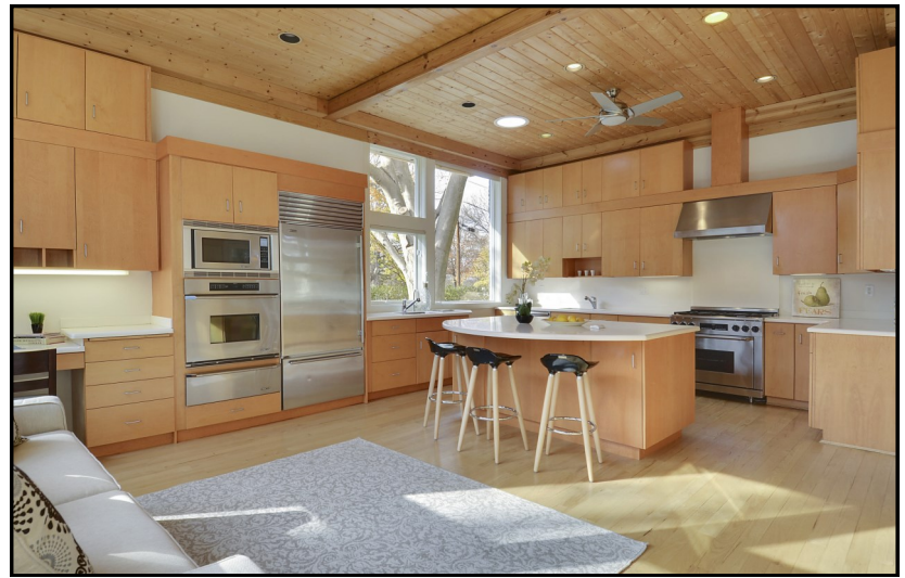
Kitchen and Sitting area