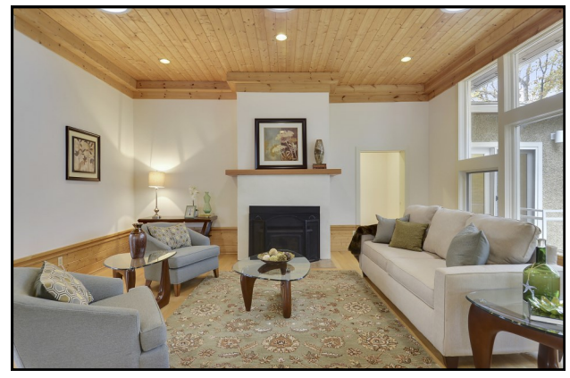
Family Room with Wood Stove