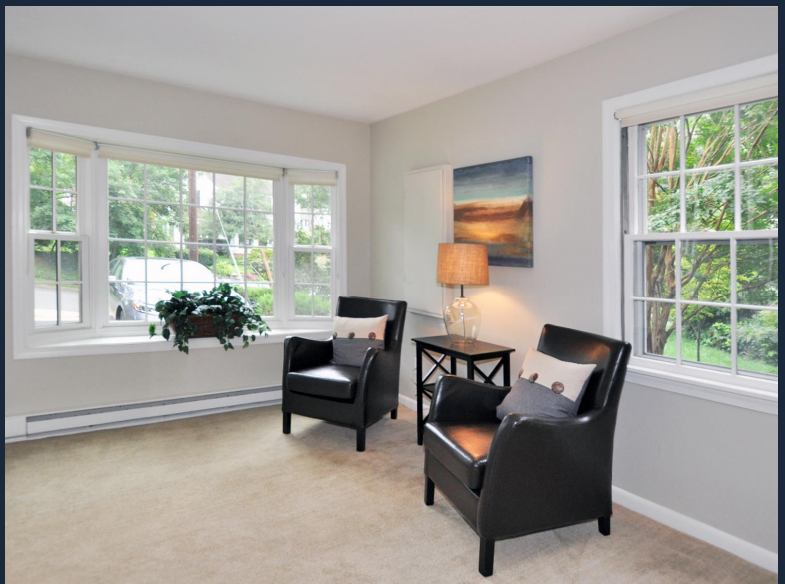
1st Floor Den