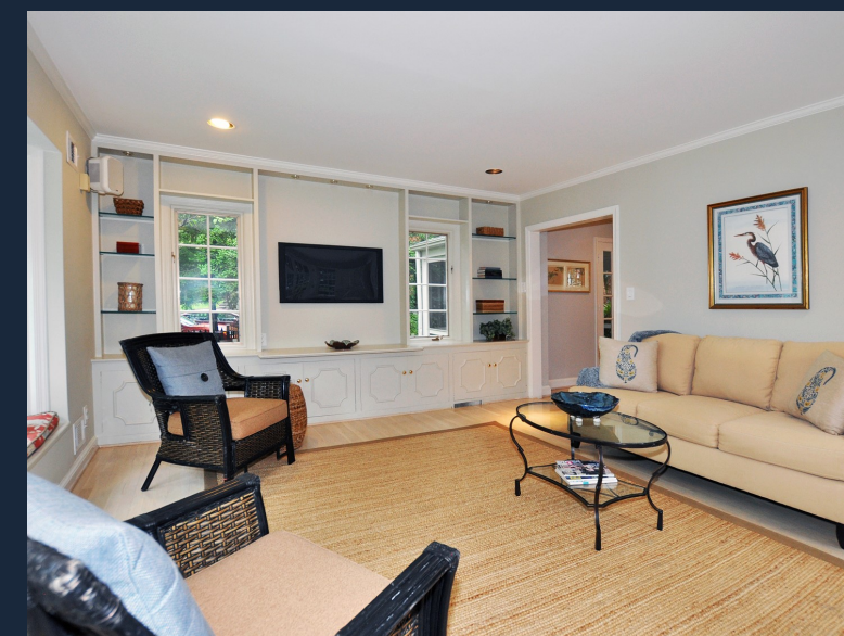
Family Room 2

Master Bedroom (13'7" x 16'5") w/many windows and a double closet.