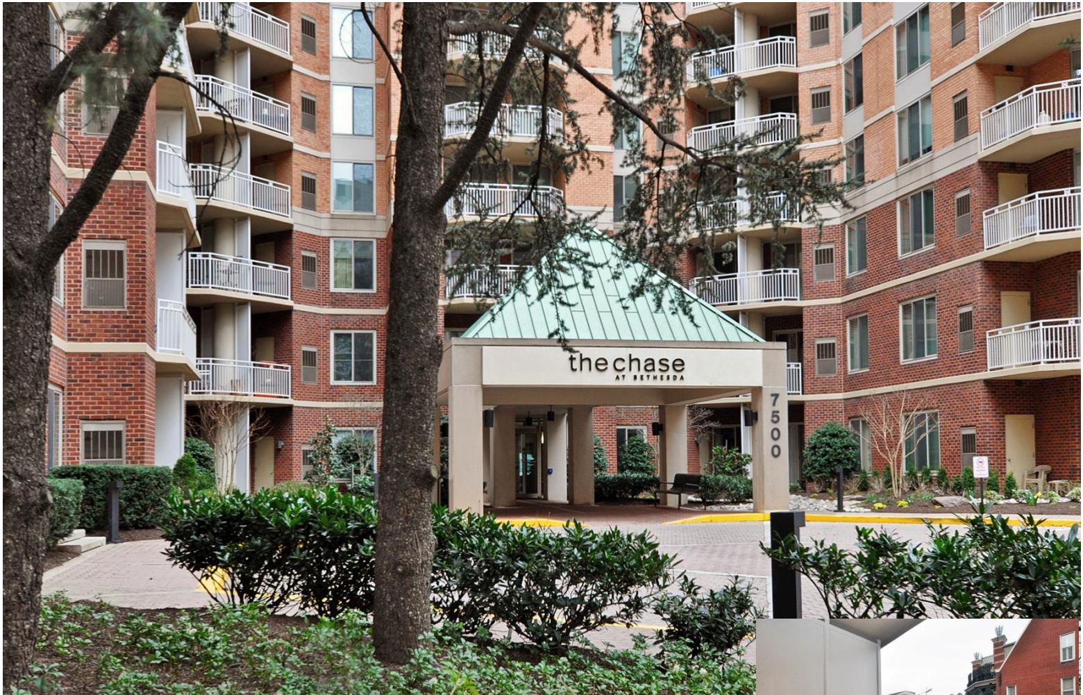
The Chase Condominium 7500 Woodmont Ave. #S903