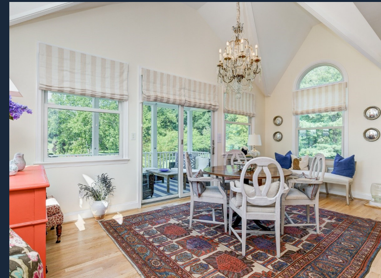
Sun Room/Breakfast room